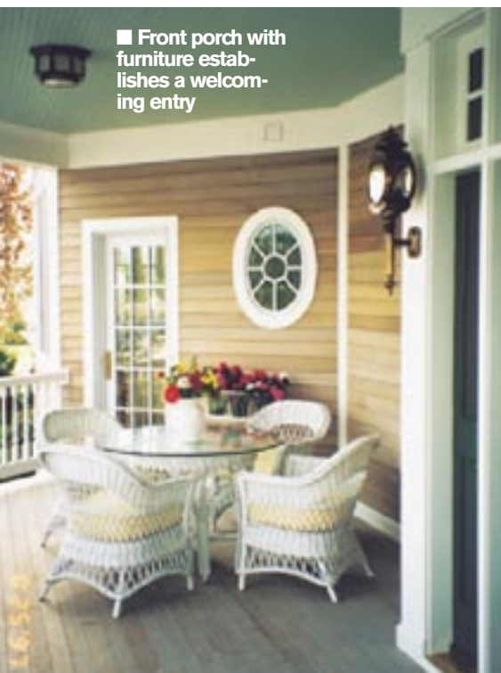
■ Front porch with furniture establishes a welcoming entry

If you're planning to build a house, don't forget a large front porch that can be enclosed in greenery. Most of all, don't forget to leave room for a large, handsomely-made porch swing. You will never regret it and neither will your children. ■