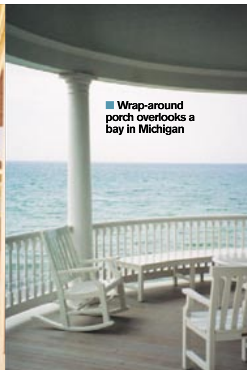
■ Wrap-around porch overlooks a bay in Michigan