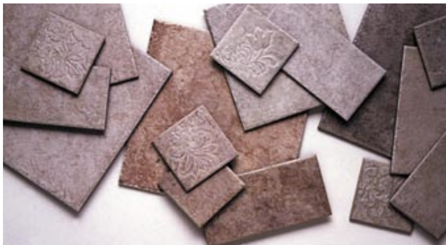
■ Above Etrusca tile manufactured by American Marazzi Tile.

When decorating with tiles, texture can make the difference between an aesthetically pleasing room and a more mundane one since any changes can not only be visually appealing but also have a unique feel to them. The texture used on machine-made tiles can create a sleek, uncluttered atmosphere; but don't hesitate purchasing tiles at flea markets or antique stores because the scratches and small chips on old tiles can add character to