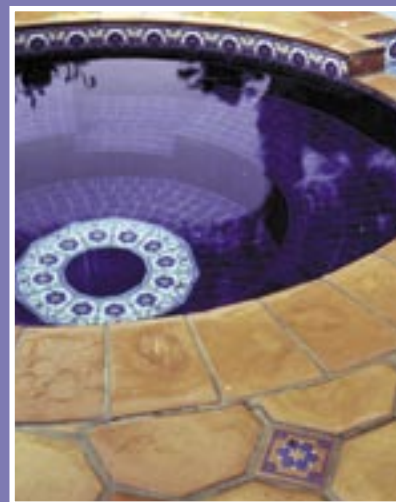
Adding color with tiles in a pool area can dramatically enhance a backyard. Flowered Malibu tile is used for this pool.