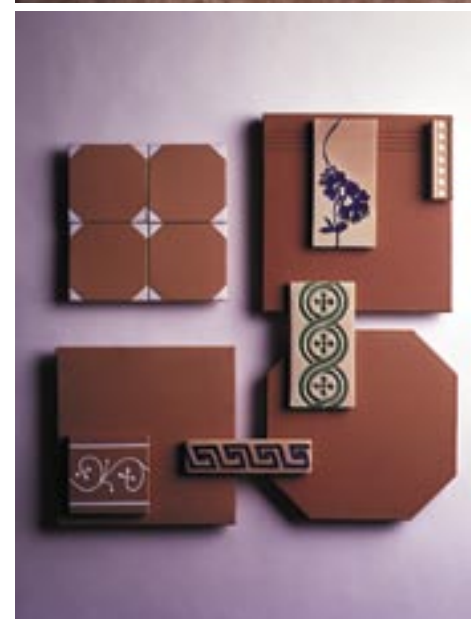
■ Opposite Page Stonelook floor manufactured by Tile of Spain. Above Top Porcelain tile manufactured by Tile of Spain. Above Center Large format marble look manufactured by Tile of Spain. Right Terra cotta tile manufactured by Tile of Spain.