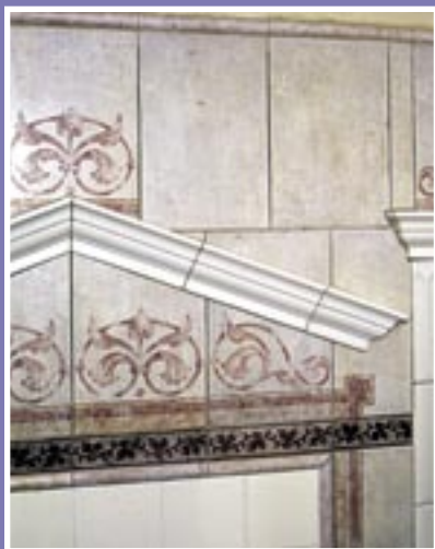
A pediment and column is created using special relief tiles and trims, and the tympanum is filled with fresco motif background tiles.