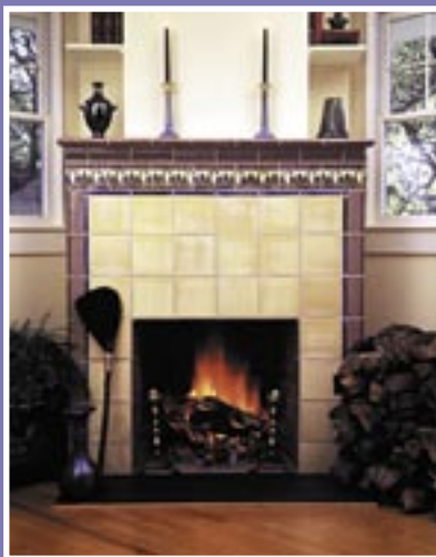
For this fireplace, tiles in a "flowing ivory" glaze, created by Falper Tile, meet with a Victorian lily border of "Chinese blue" glaze.